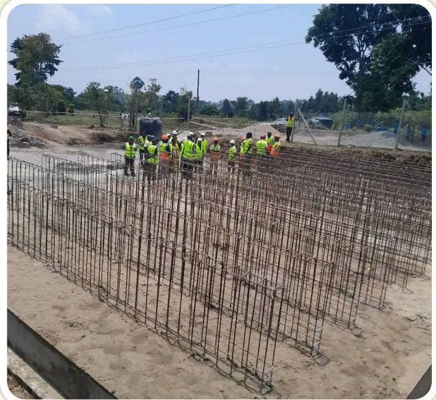
Construction of the water reserve tank (1)

T he government has embarked on the construction of Nyamugasani Water Supply and Sanitation Project, a multi-billion-shilling initiative expected to increase access to clean and safe water across Kasese District.