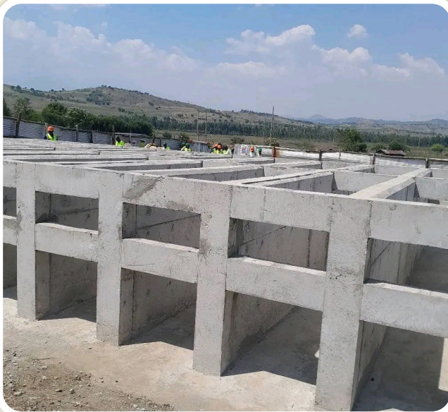
Construction of the water reserve tank (2)