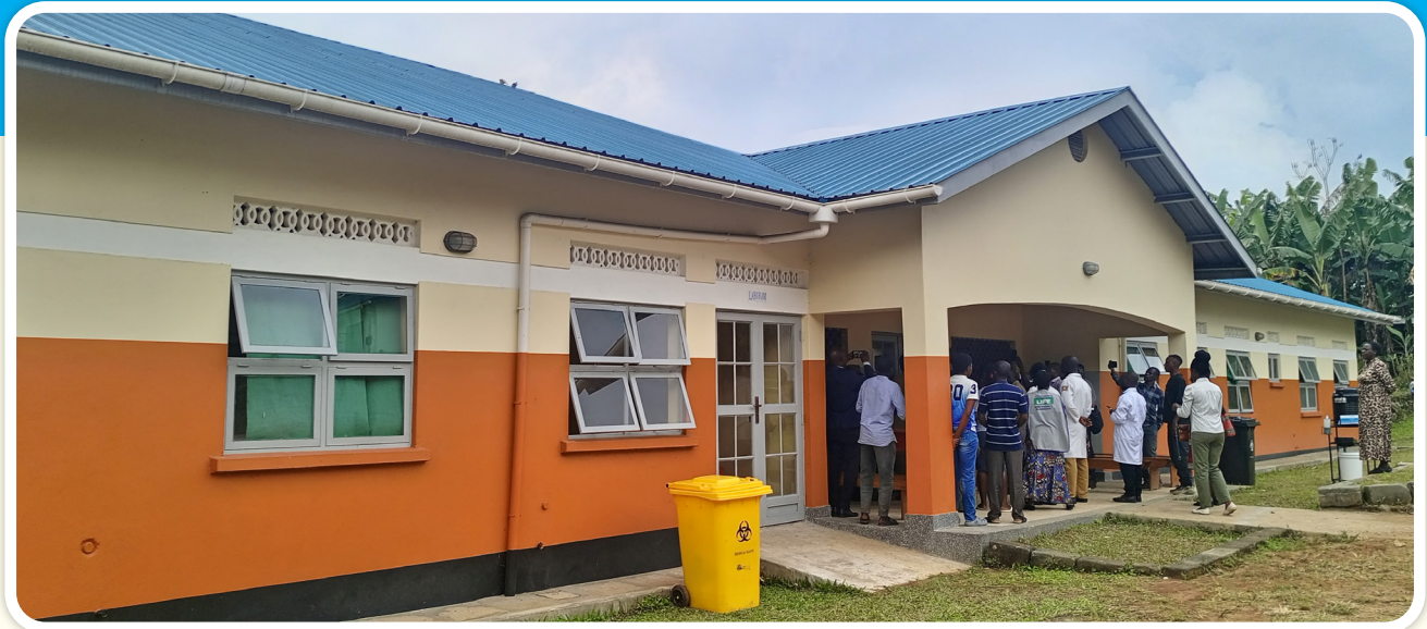
Leaders at the commissioning of Kidubuli HC3 (1)