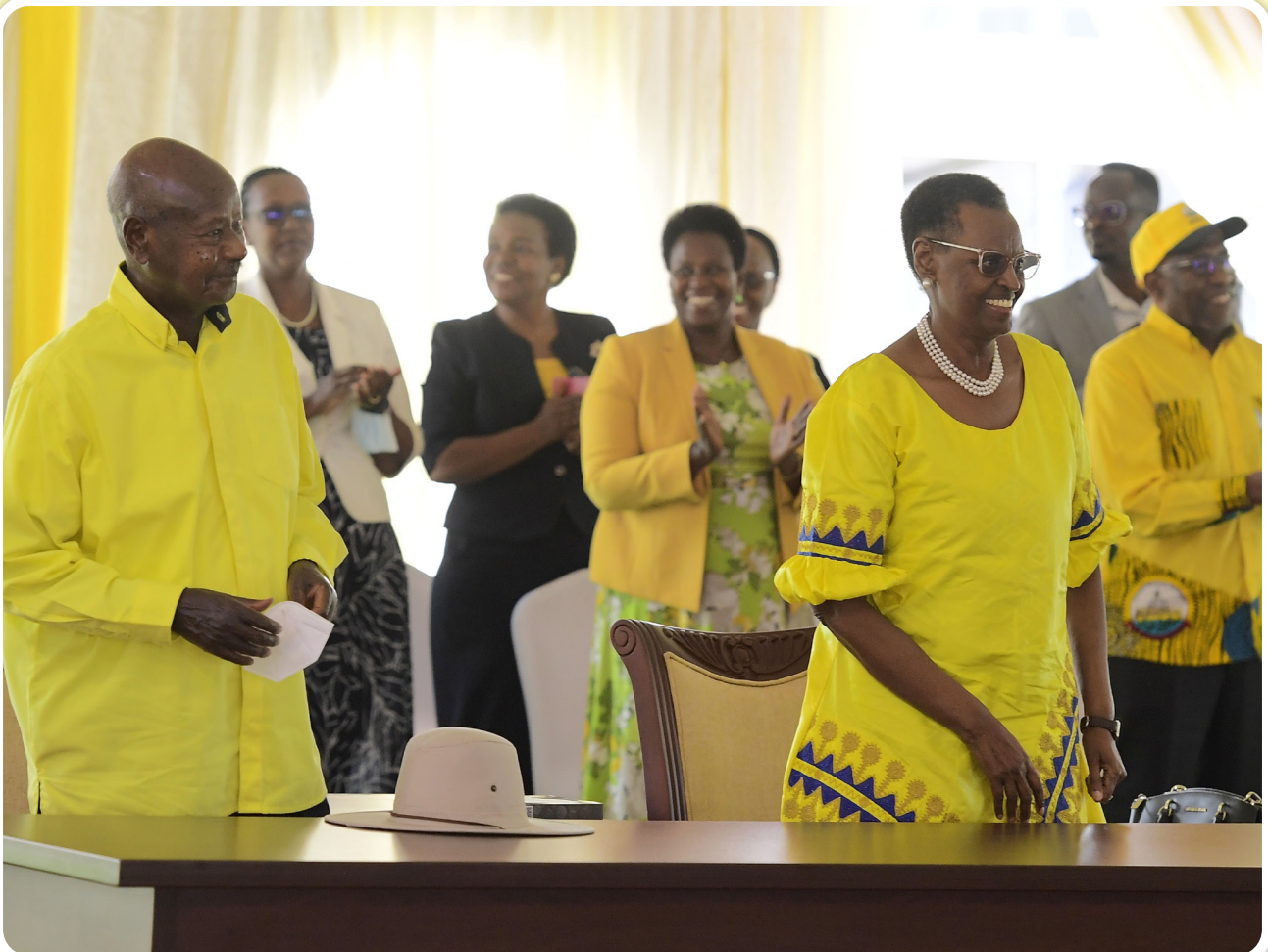
President Museveni shortly after being nominated by the EC

Museveni will kick off his campaigns from Luwero region on 30th September, 2025.