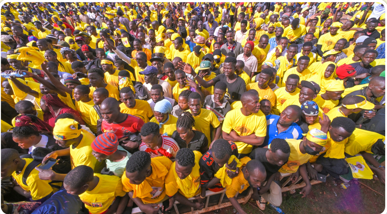
A huge group of NRM supporters who welcomed Museveni after nomination

The President unveiled a range of new initiatives, including a special fund for jobless graduates, financial support to cultural and religious leaders, Shs15 million allocations to leaders’ SACCOs at parish level, and a fishermen’s support fund. He also promised to scale up the Parish Development Model.