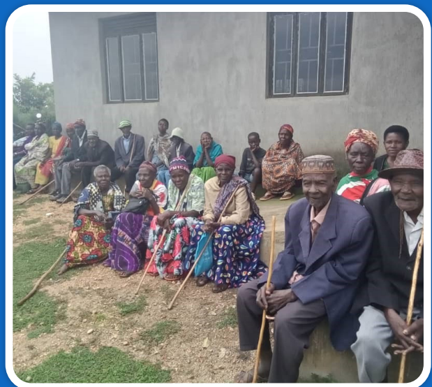
Elderly persons at Biguli Town Council headquarters

The SAGE initiative has been widely credited with improving the welfare of vulnerable households across Uganda. Officials in Kamwenge say the ongoing payments reaffirm government's commitment to providing social protection and financial empowerment for the elderly.