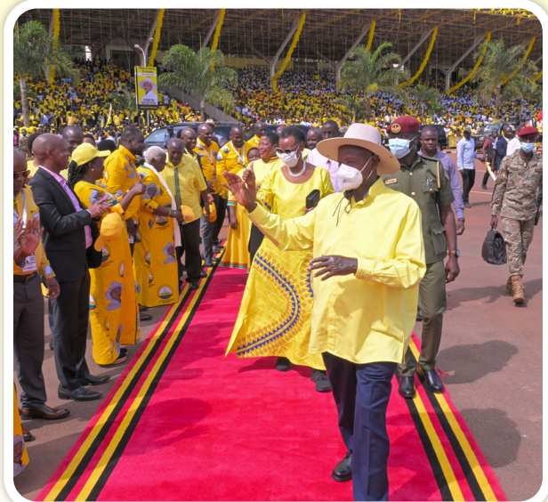
President Museveni accompanied by First Lady Mama Janet arrived at Kololo Ceremonial Grounds after being nominated

Museveni, accompanied by First Lady and Education Minister Janet Kataaha Museveni, senior NRM officials, and members of the Central Executive Committee (CEC), expressed gratitude for