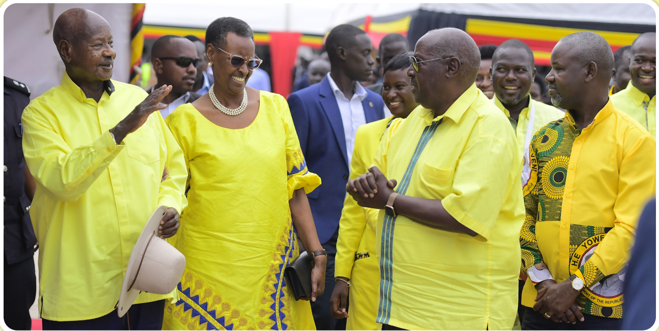
President Museveni with NRM leaders shortly after nomination

P resident Yoweri Kaguta Museveni has pledged to deliver a massive economic boom and improved service delivery in his next term of office after being nominated as a presidential candidate for the 2026 general elections.