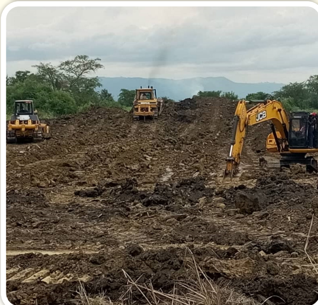
Dam construction in Kajweka Parish, Kanara Sub county, Ntoroko district

desilting works and cash-based assistance to vulnerable flood victims.