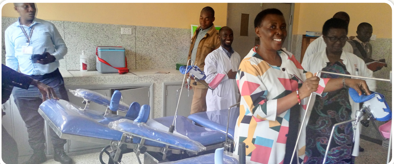
Health officials and leaders excited to see the well equipped facility

Before this development, residents relied on a modest Health Centre II, which referred most complicated cases to Fort Portal, often at high financial and emotional cost.